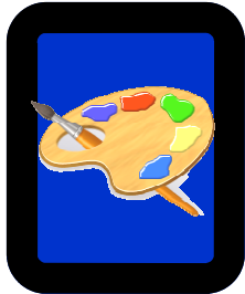
Ministry in the Arts

Come join the Lake Ridge Worship Choir, and MAKE A JOYFUL NOISE! The choir rehearses on Wednesday evenings in the Sanctuary, from 7:00-8:30 p.m. Our season is from September through May, with only a couple of meetings in the Summer. The choir sings for many Sunday morning services throughout the year, and it also plays a large part in the celebration of Christmas and Holy Week. We sing together, pray together, and play together. Come be a part of worship and praising the Lord in song.