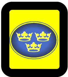
Crown Financial Ministries

A brief overview of the fall offerings from the Lake Ridge App Store is as follows: