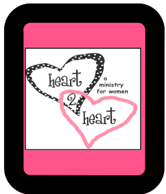
Connections Bible Study