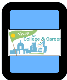
College & Career